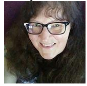
By Wendy Harris

Save the Date Saturday, June 20 is Late Model/World Figure 8, Factory FWD, Junior Faskarts, Legends, Ford Oval & Figure 8 at the Speedrome and it's